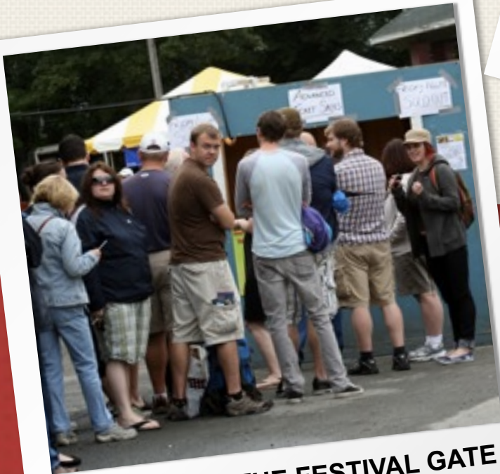
CROWDS AT THE FESTIVAL GATE